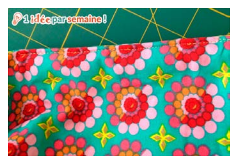
And sew by hand or with a sewing machine. Voilà! Your purse is finished!

Our high quality velvet is machine washable, up to 100°F, and can be tumble dried.