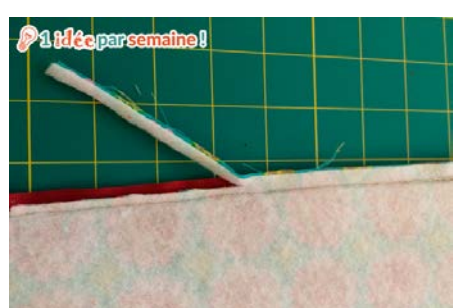
If you used interfacing or Pellon, trim the seams.