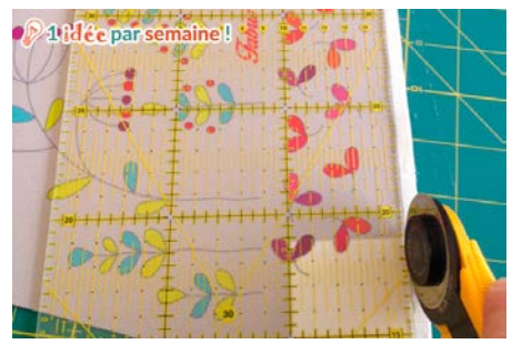
Have fun! Véronique and Bénédicte

You can either hand stitch, with even backstitches and a good quality thread, or use a sewing machine. If you use a sewing machine, use the zipper presser foot if you have one. It is a narrow presser foot as seen on the photos.