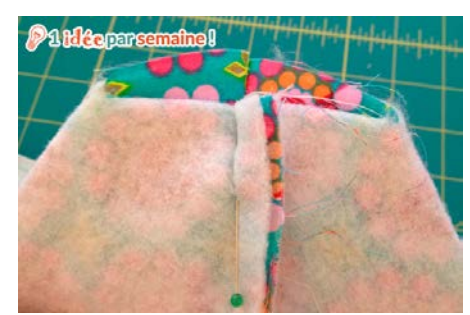
Crush the corners flat, connecting the seams face to face.