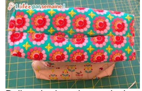
Delicately close the gap in the lining.