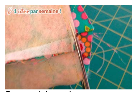
Sew and then trim your seams to reduce the bulk in the corners.